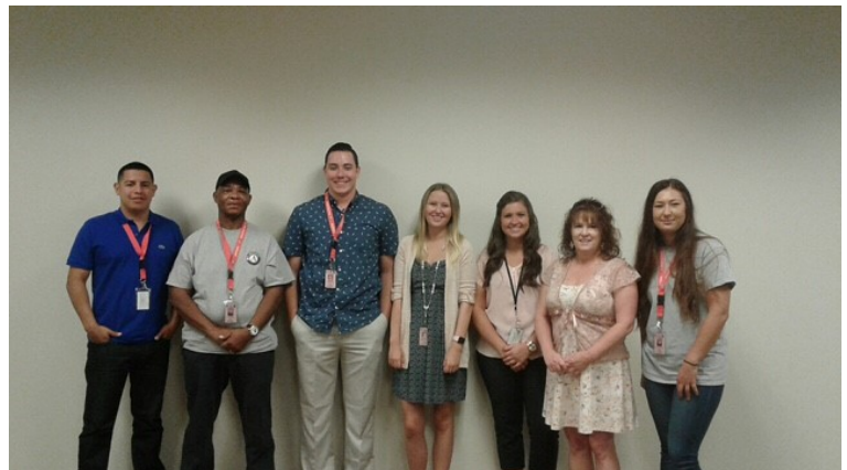
AmeriCorps members from Maricopa County Adult Probation May, 2017